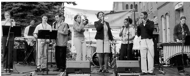
City Music All Star Band performing on July 27 at the Boston Center for the Arts Plaza as part of "Hip and Historic", an event sponsored by the South End Business Alliance in association with the Democratic National Convention.