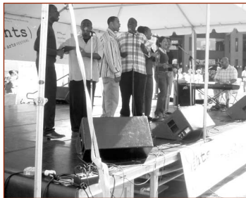
City Music Gospel Ensemble.

The second annual Boston Arts Festival was held on September 11 and 12 at Christopher Columbus Park. This year's fabulous event was sponsored by JP Morgan Chase, and Brown and Company, and was designed to showcase Boston's best visual and performing artists, as well as to kick off the fall arts season in the surrounding area.