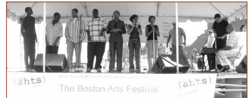
City Music Gospel Ensemble.

Strong and Mighty." The program continued with traditional spirituals and contemporary gospel music. Performing to a